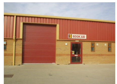
Above and below - Wisbech Warehouse. Newly opened in October 2008