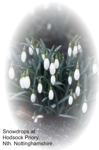
Snowdrops at Hodsock Priory, Nth. Nottinghamshire.

The cloud, however big or small, is a harbinger of blessing. It was