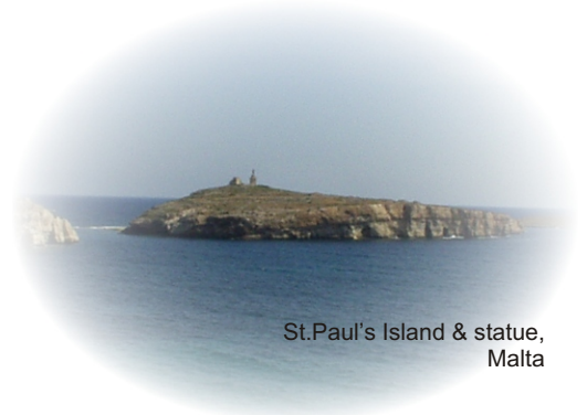
St. Paul's Island & statue, Malta

Have you noticed that before a heavy storm there are often rumblings of thunder - the same is true in the spirit, there are rumblings and stirrings in the hearts of the prophets that a spiritual refreshing is about to come.