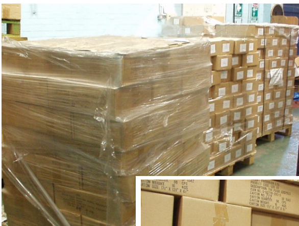
Just some of the twenty pallets of Gospels - saved from the dump

Please pray that these will arrive safely (expected early Feb) and quickly into the hands of Bible-less believers in this very needy land.